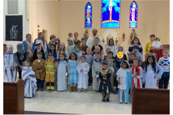
Students dressed as their favorite Saint during Thursday Mass