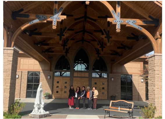
Staff took a trip to Redmond, OR to collaborate with other Catholic schools in the area!